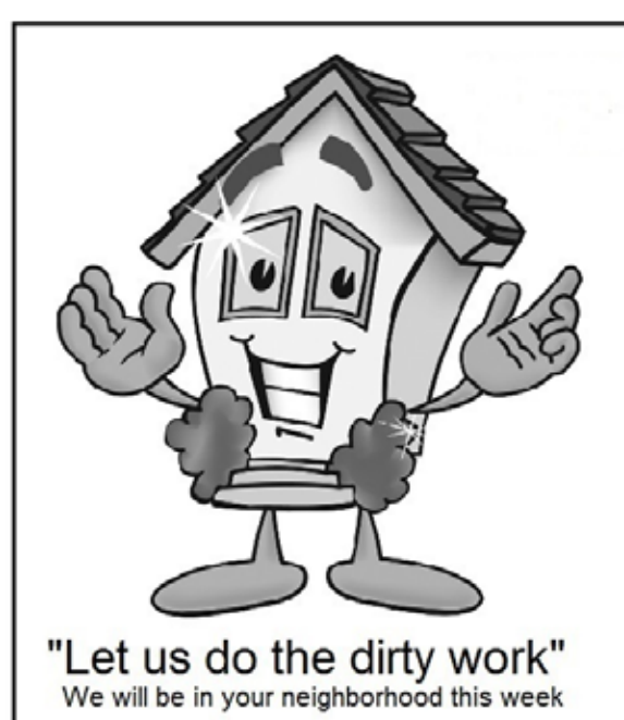
Are YOU a Good Neighbor?